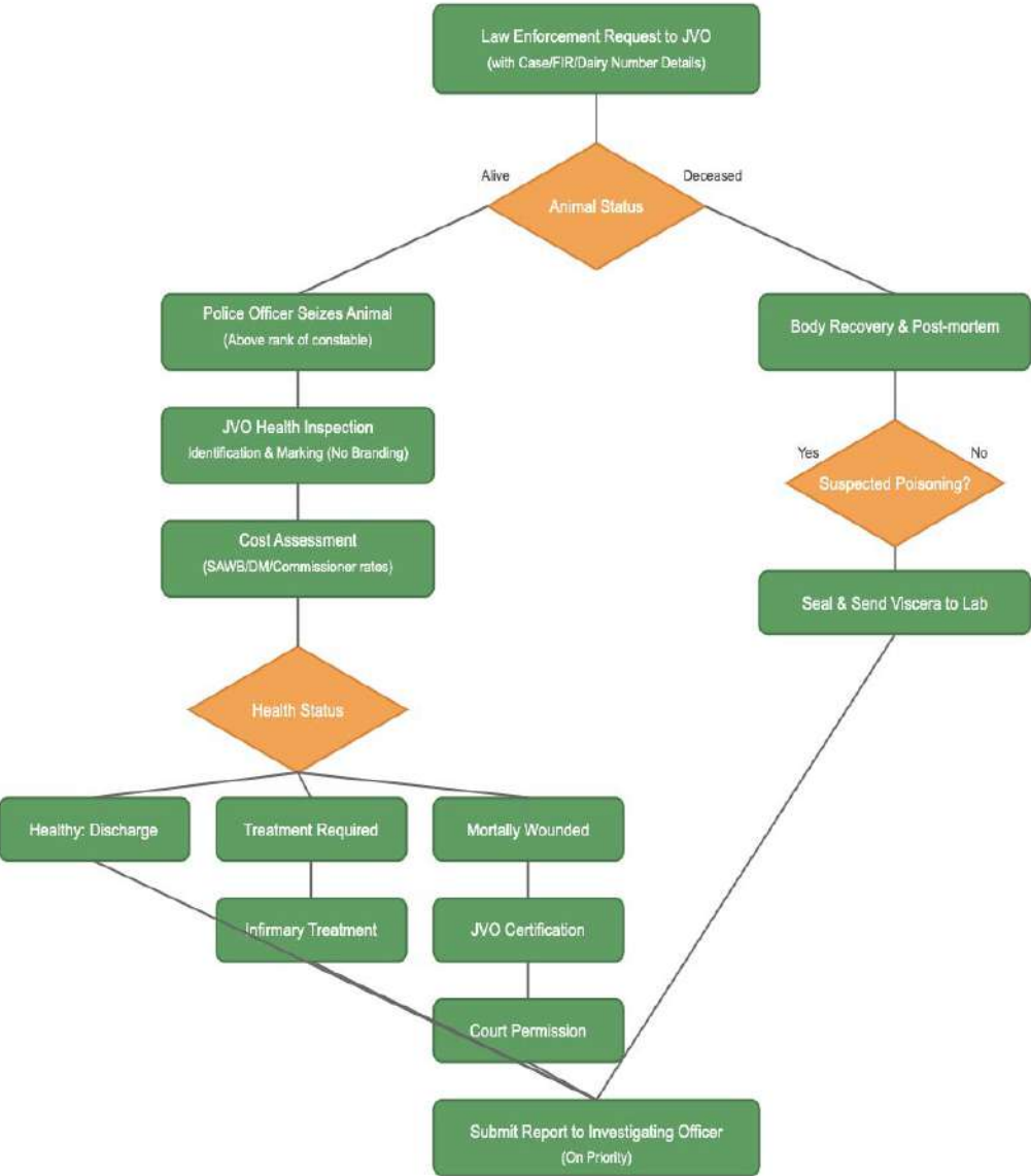
Standard Operating Procedure Flowchart for Veterinary Officers Conducting Animal Cruelty Investigations under PCA Act