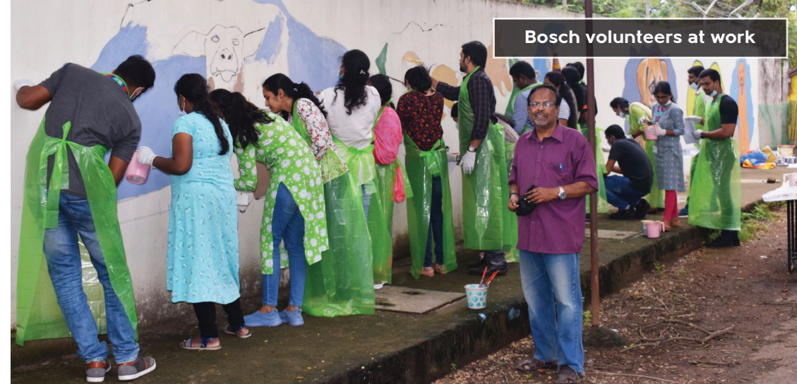
Bosch volunteers at work

Our student engagements comprised visits to our centre by students of four institutions from Coimbatore: GD School, VCV