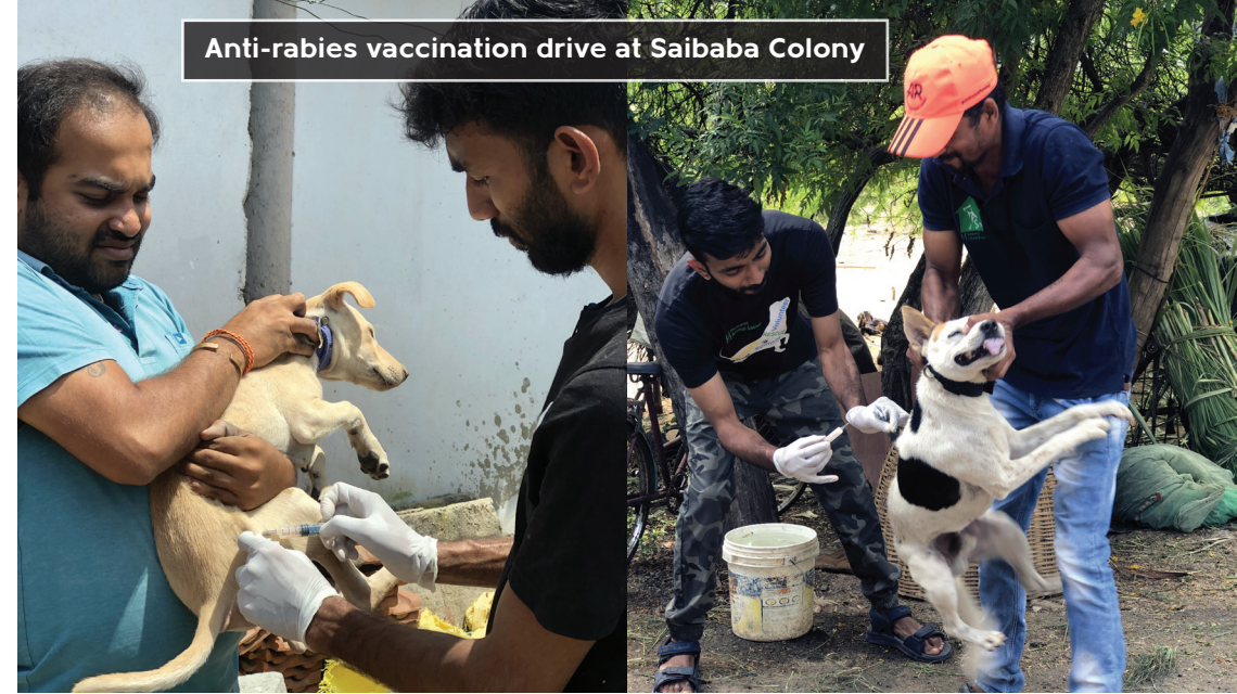
Anti-rabies vaccination drive at Saibaba Colony

Coimbatore administration to conduct a sterilisation program at the Ukkadam Sterilization Center in December 2022. Fifty-five street dogs were sterilised and released in their respective territories. These programs will eventually help control the stray animal population in the city and reduce human vs animal conflicts.