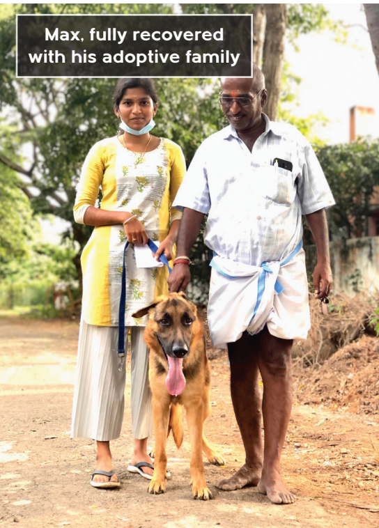
Max, fully recovered with his adoptive family

Danny fell victim to human cruelty with a rubber band looped around his neck causing grievous injury and pain. Danny received daily treatment for his wounds that finally healed with suturing. Danny recovered well enough within 3.5 months for us to return him to his natural habitat, watched over by a loving citizen who continues to be Danny's guardian.