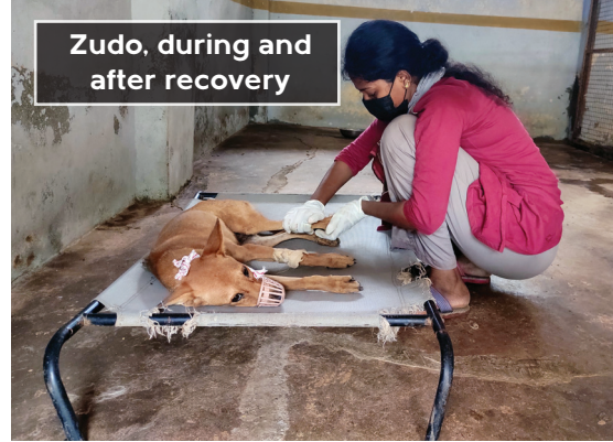
Zudo, during and after recovery

Max was found abandoned in a dump yard with maggot-infested wounds on his head. His journey