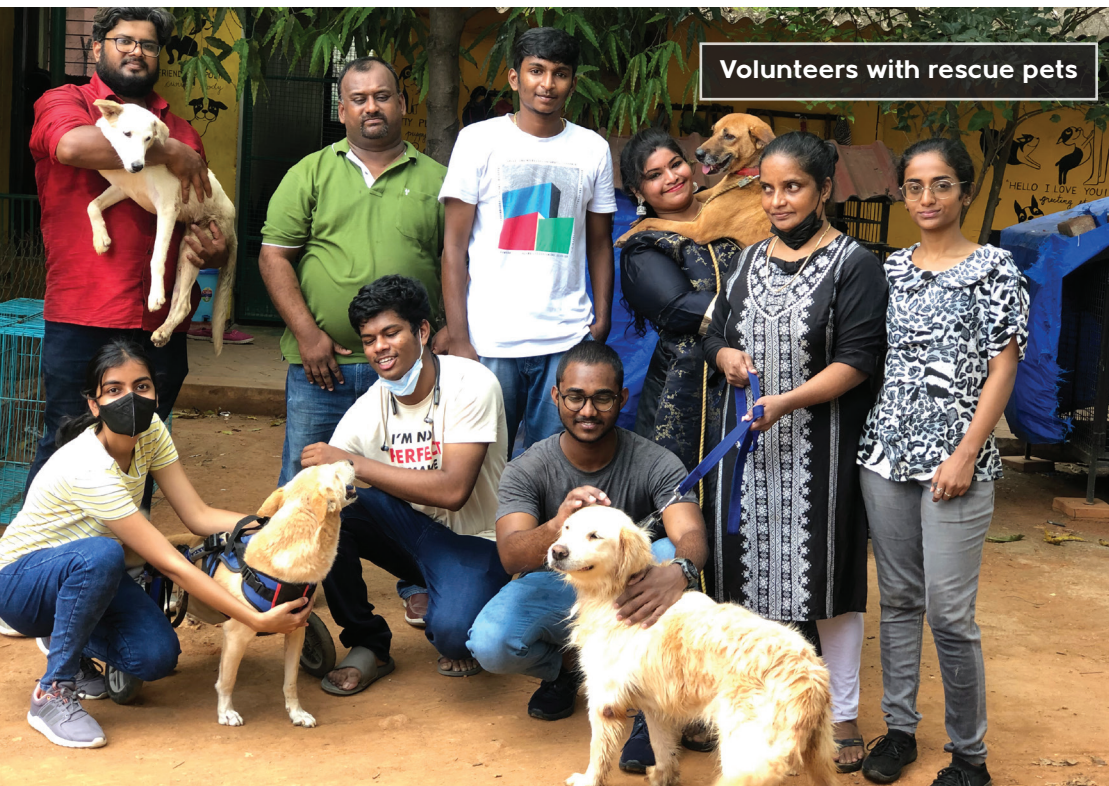
Volunteers with rescue pets

Ford Motors has similarly supported us by funding various animal welfare activities and drives. We thank our corporate partners for their continued support in helping us help street animals and raising awareness about animal welfare.