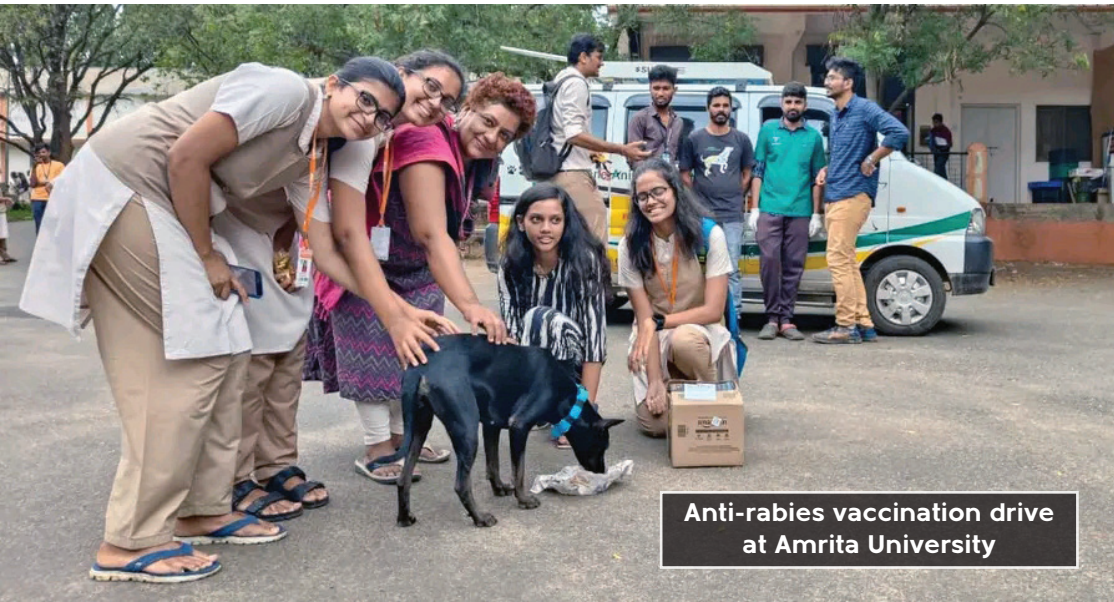
Anti-rabies vaccination drive at Amrita University